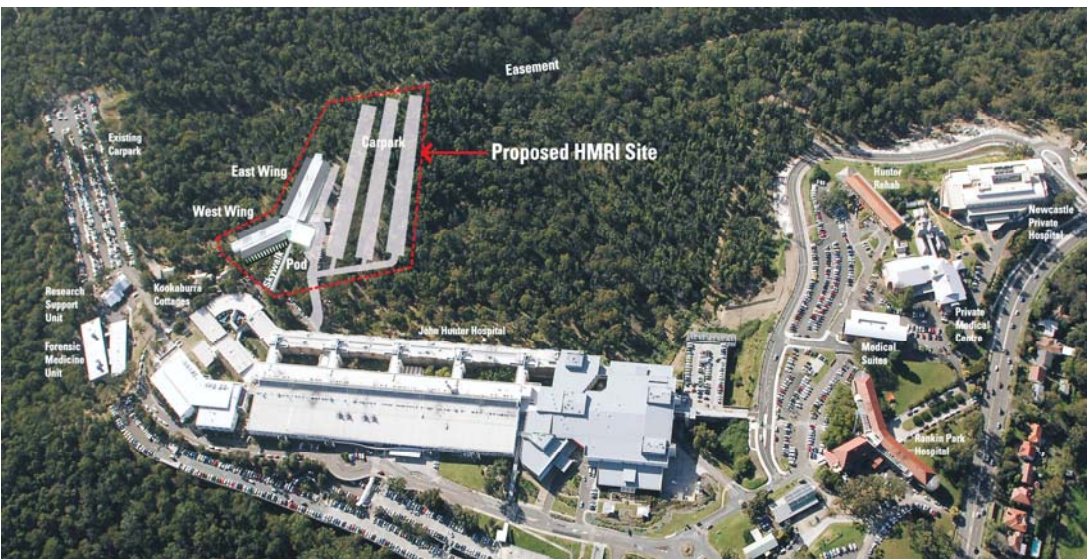
An aerial view of the Rankin Park Campus showing the location of the HMRI Building and car parking.

High resolution images of the Building are available on request.