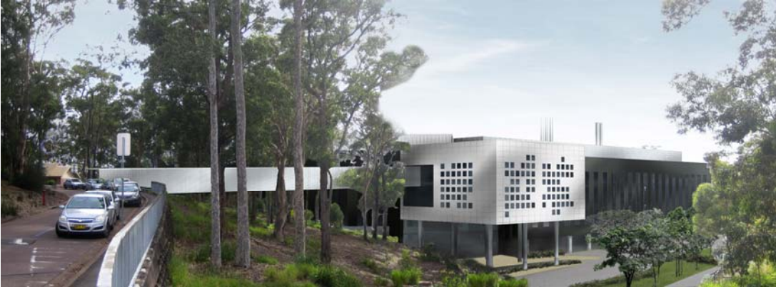
An artist's impression of the HMRI Building from Kookaburra Crescent